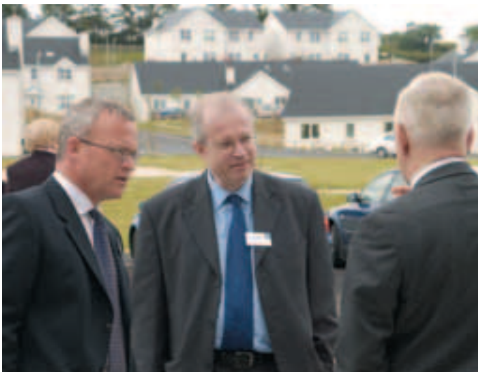
Board and Staff at Abbey Village opening