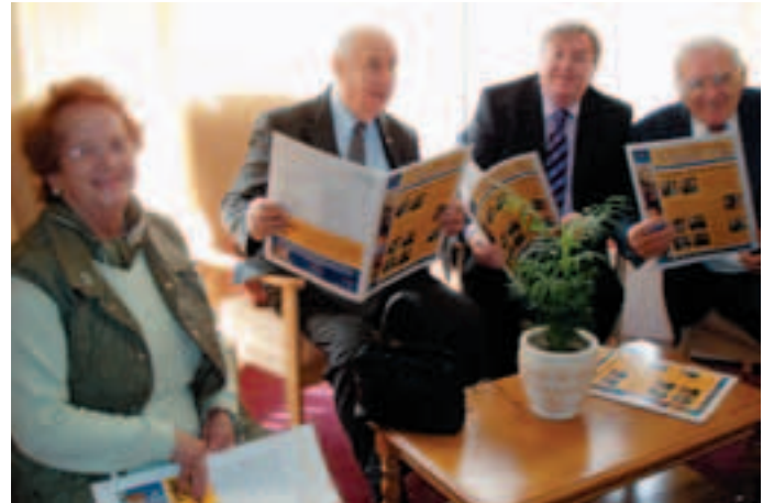
Board Members reading Tenants' Newsletter