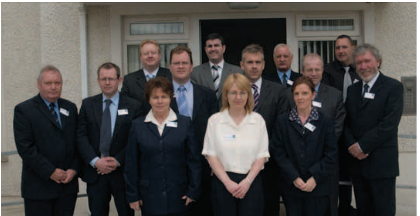
Staff in attendance at opening of Abbey Village