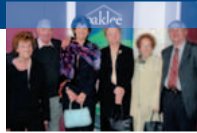
Oaklee Housing Association Board visit

The dream at Oaklee of creating social housing to meet all types of need throughout Ireland became a reality for us this past year, when the Trust handed over three schemes and created well over 200 new tenancies.