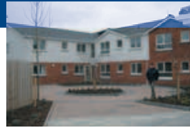
Hawthorn Court, Celbridge

It has been an eventful year for Oaklee Housing Trust with the completion and handover of three developments at Hawthorn Park, Celbridge, County Kildare, James's Street, Dublin and Abbey Village, Kilmacrennan, County Donegal (199 dwellings) mean that these are the Trust's first operational schemes and as such mark the transition between construction activities and ongoing housing management and maintenance functions.