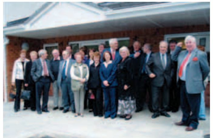
Board visit to Hawthorn Court