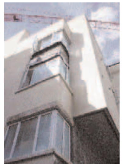
James's Street, Dublin