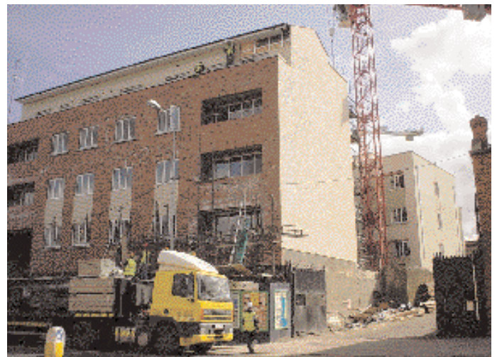
James's Street under construction