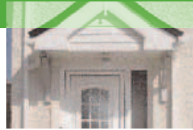
The finishing touches

It has been very satisfying to note the progress made by Oaklee's Development and Housing staff. Clerk of Works and Technical staff are in direct contact with the developers on site and keep management informed as development progresses. Similarly, Housing Management staff have been busy building up relationships with local councils and other housing associations as well as concentrating on the preparation and production of tenancy literature. Pre-tenancy induction is something new to our staff, but they have welcomed it gladly and, indeed, found the process to be of great benefit in conveying information to tenants.