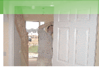
The finishing touches

During the year ended 31 March 2004 the company had a turnover of €202k, up from €87k in the previous period. This reflects the significant increase in development activity during the year. Operating expenses were €161k and interest payments €57k, leaving a retained loan of €16k.