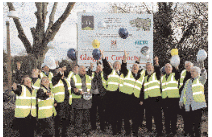
Sod Cutting at Celbridge