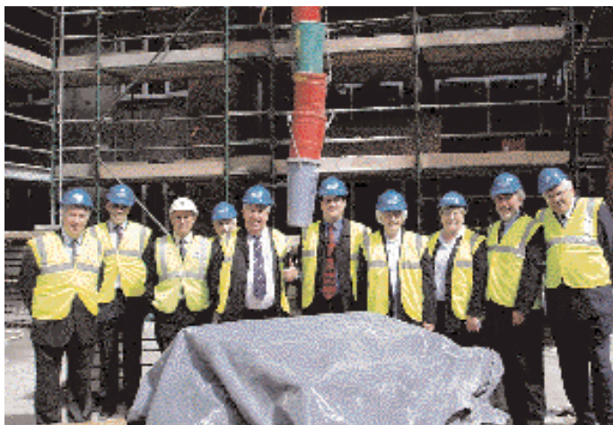
Board Members site visit at James's Street

have largely been financed by Housing Loans from local authorities, which were at €26.1M, up from €10.9 in the previous year. Funding to meet the company's working capital requirements continues to be provided by Oaklee Housing Association, with the inter-company balance standing at €1M. During the year, the company successfully negotiated an additional banking facility of €1.5M from AIB Group, which will be used to fund development projects and to meet future working capital requirements.