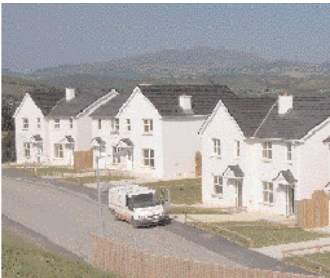
'Abbey Village', Kilmacrennan