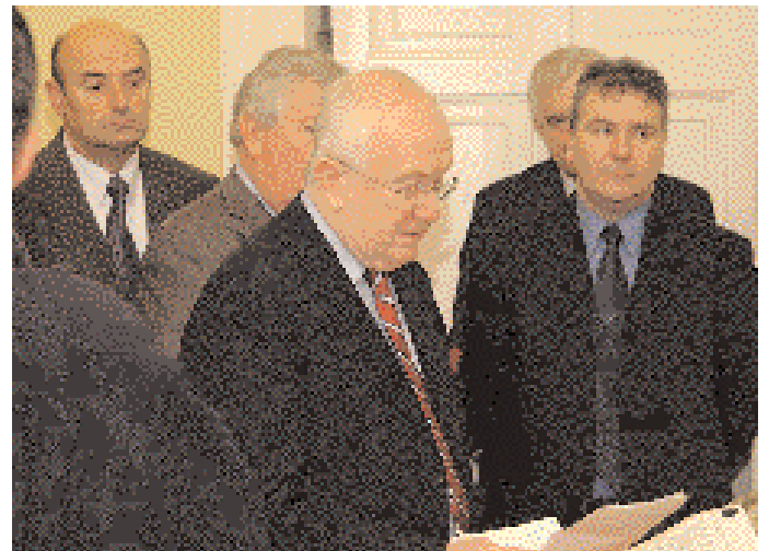
Pat The Cope Gallagher announces funding for Kilmacrennan development

In Celbridge, we celebrated the sod-cutting in the early part of the year, and the 44-apartment sheltered scheme is now well advanced. As with Dublin and Donegal, we pay tribute to the excellent standards of work by our Consultants and Contractors who, working with our Clerk of Works, have made such progress possible. This level site will enhance town life in Celbridge and allow many people from the area to remain in their familiar community.