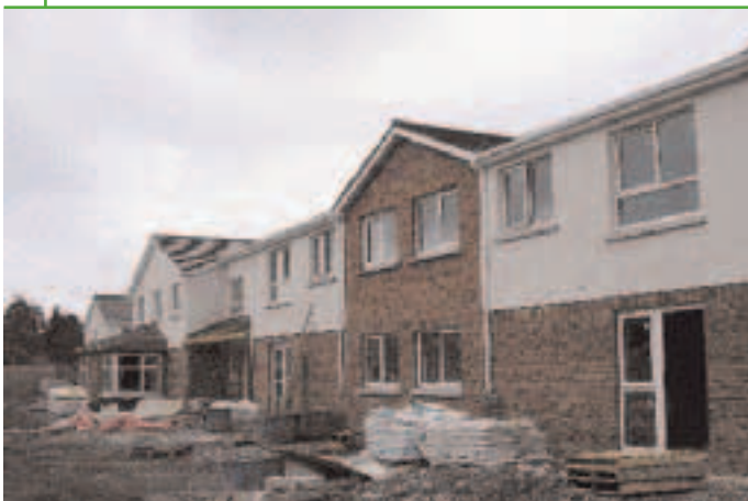
Hawthorn Park, Celbridge