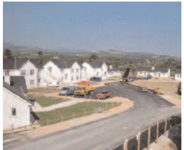
'Abbey Village' under construction